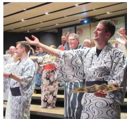
Programs for foreign visitors