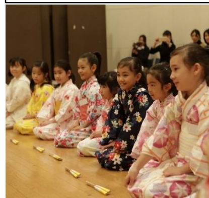
Programs for children

The latest information for programs in the future will be updated on the following official website (in Japanese and English)