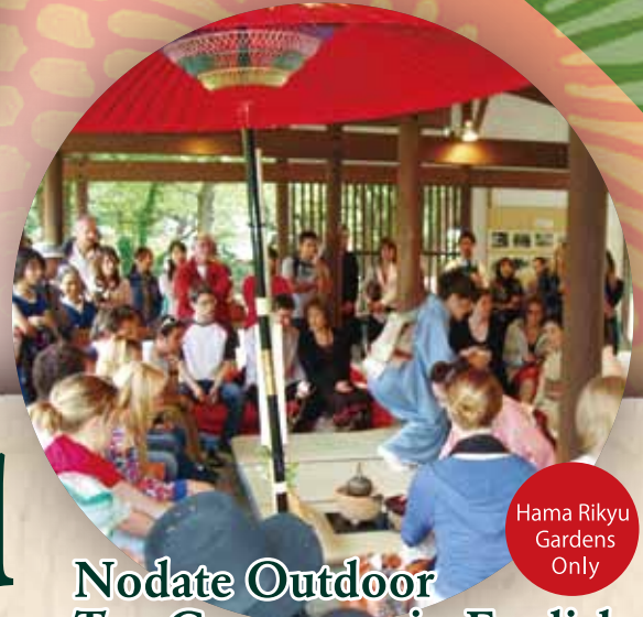
Nodate Outdoor Tea Ceremony in English Hama Rikyu Gardens Only