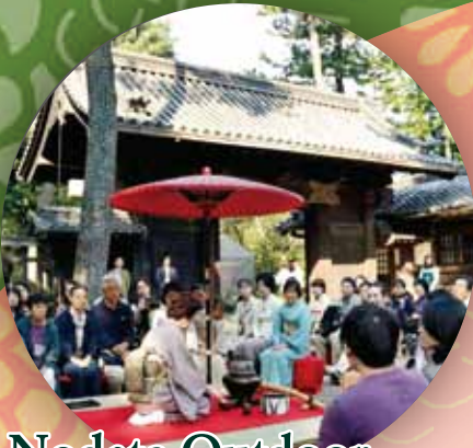
Nodate Outdoor Tea Ceremony