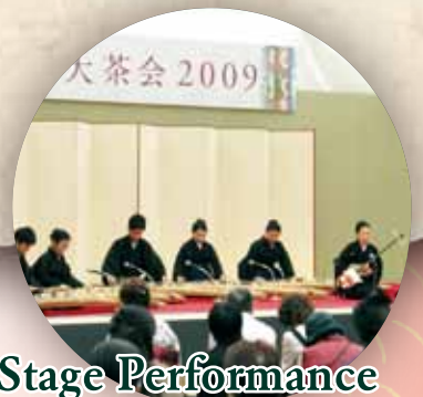
Stage Performance and Events Hama Rikyu Gardens Only

Enjoy the introductory program with English explanations as well as traditional Japanese stage performances.