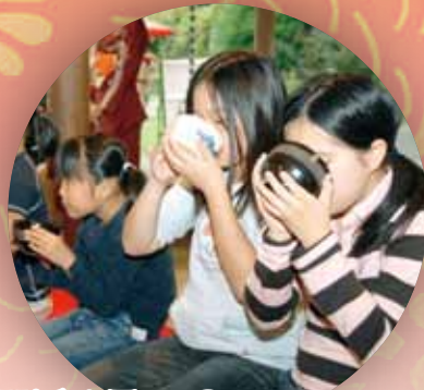
Kids' Tea Ceremony