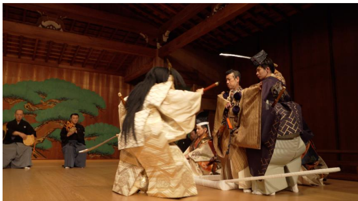
Yoshitsune and Benkei fight against Tomomori