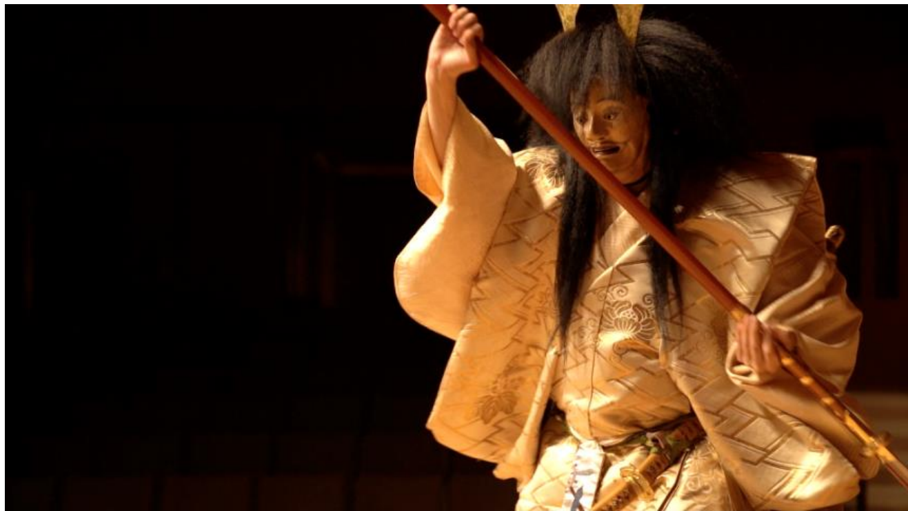
Taira no Tomomori (From "Noh Online: Funa Benkei, Legendary Hero, Riding the Wave from Tokyo to the World")

Based on the theme "Approaching Tokyo Tradition", Arts Council Tokyo, Tokyo Metropolitan Foundation for History and Culture, offers diverse projects and programs for people who are not familiar with traditional arts and culture, as well as for people overseas and children to enjoy Japan's authentic traditional arts and culture.