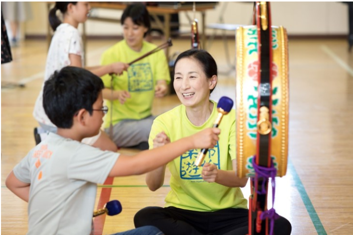
Traditional Culture and Performing Arts Experience Program for Kids