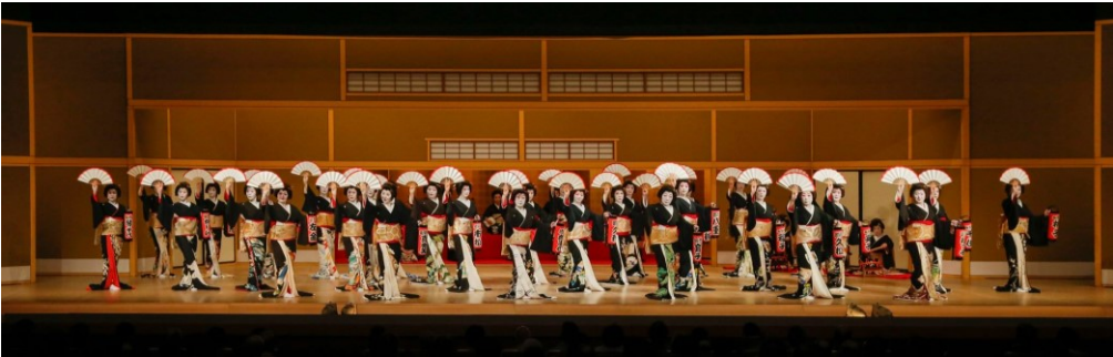
Geisha dancers and musicians from 6 entertainment districts