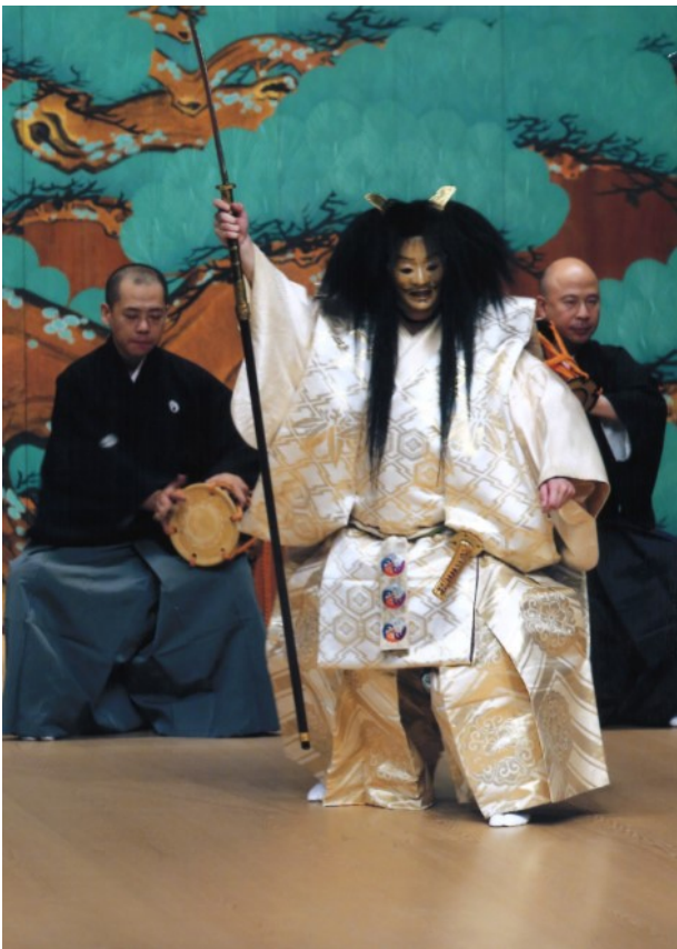
Noh “Funa Benkei”